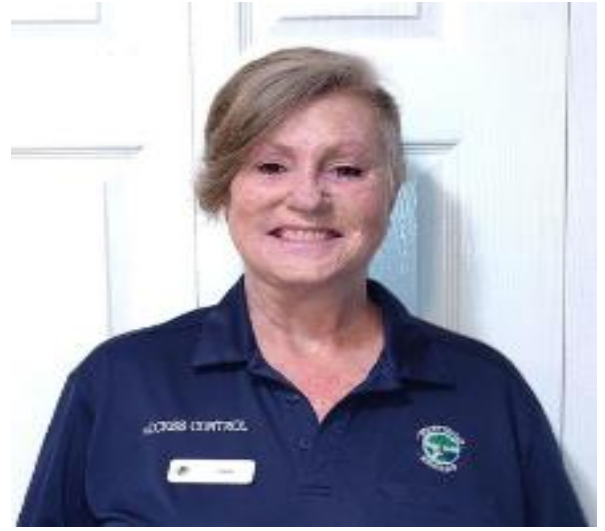
LENA EWART/ACCESS CONTROL