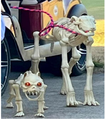
HALLOWEEN FUN ON THE PATIO!